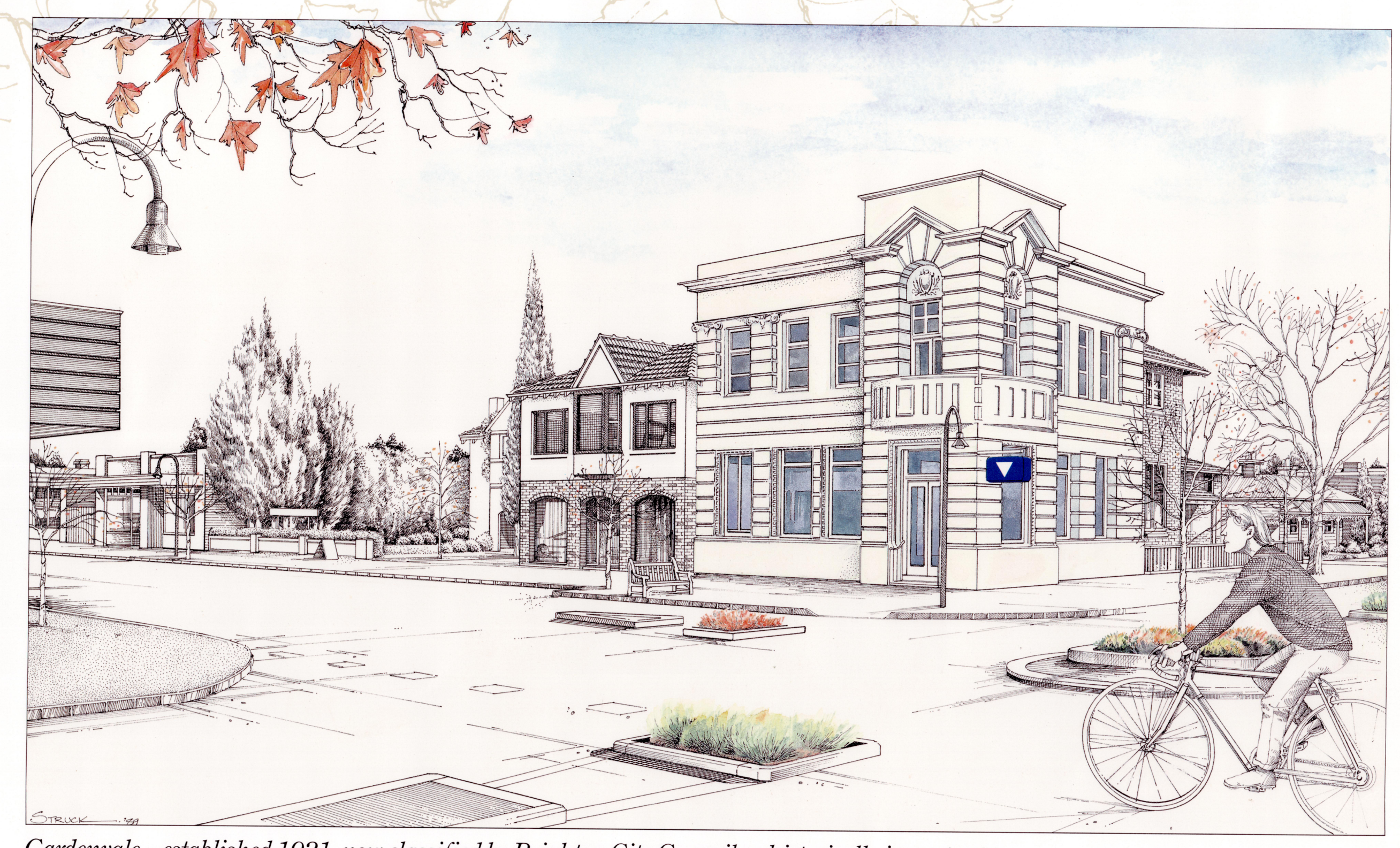
Gardenvale - established 1921, now classified by Brighton City Council as historically important.

J S M T W T F S M T W T F S M T W T F S M T W T F S M T W T F S M T W T F S M T W T F S A 2 3 4 5 6 E 1 2 3 A 1 2 3 N 7 8 9 10 11 12 13 B 4 5 6 7 8 9 10 R 4 5 6 7 8 9 10 R 4 5 6 7 8 9 10 R 4 5 6 7 8 9 10 R 4 5 6 7 8 9 10 R 4 10 11 12 13 14 15 16 17</t