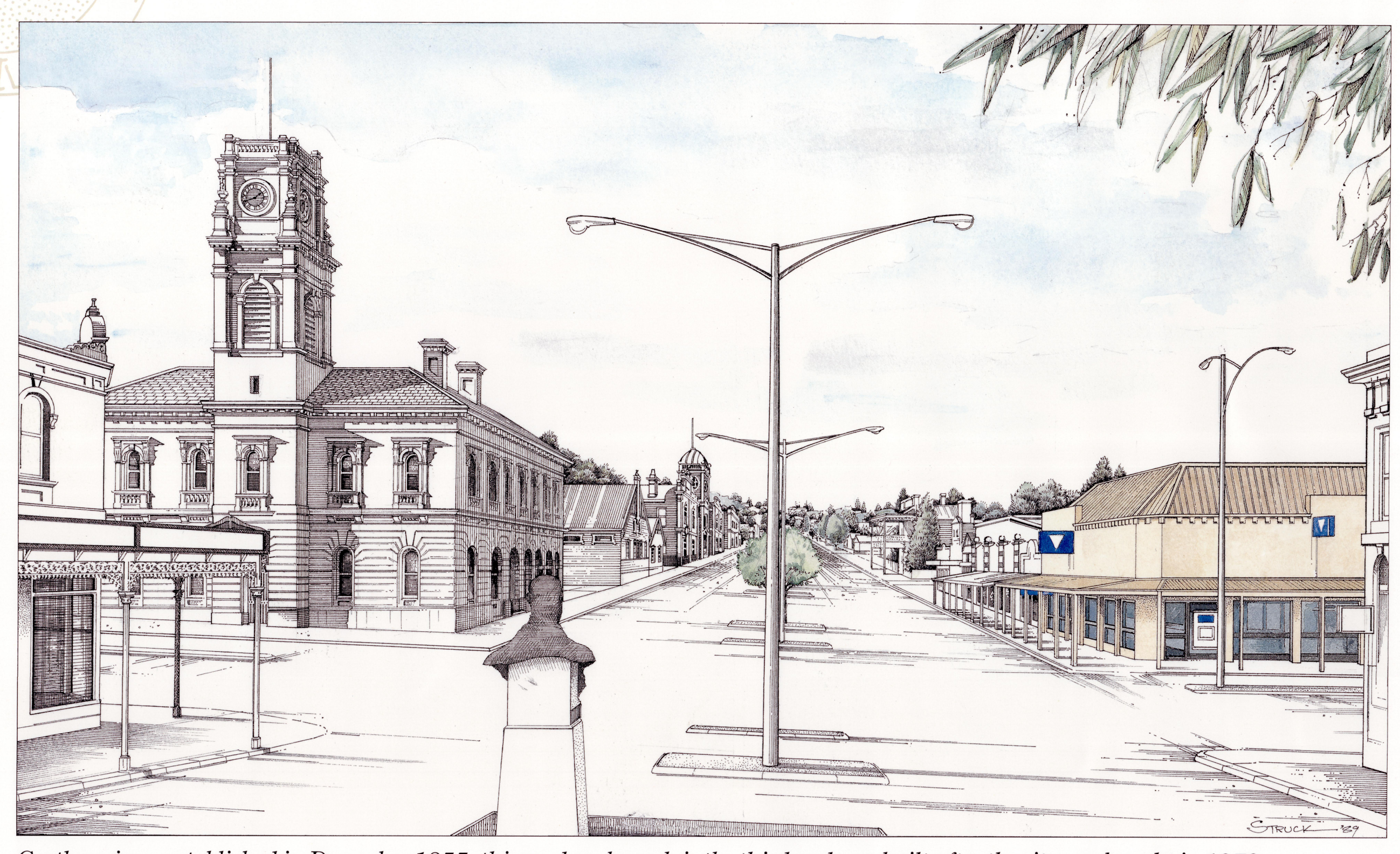
Castlemaine – established in December 1855, this modern branch is the third and was built after the site was bought in 1979.