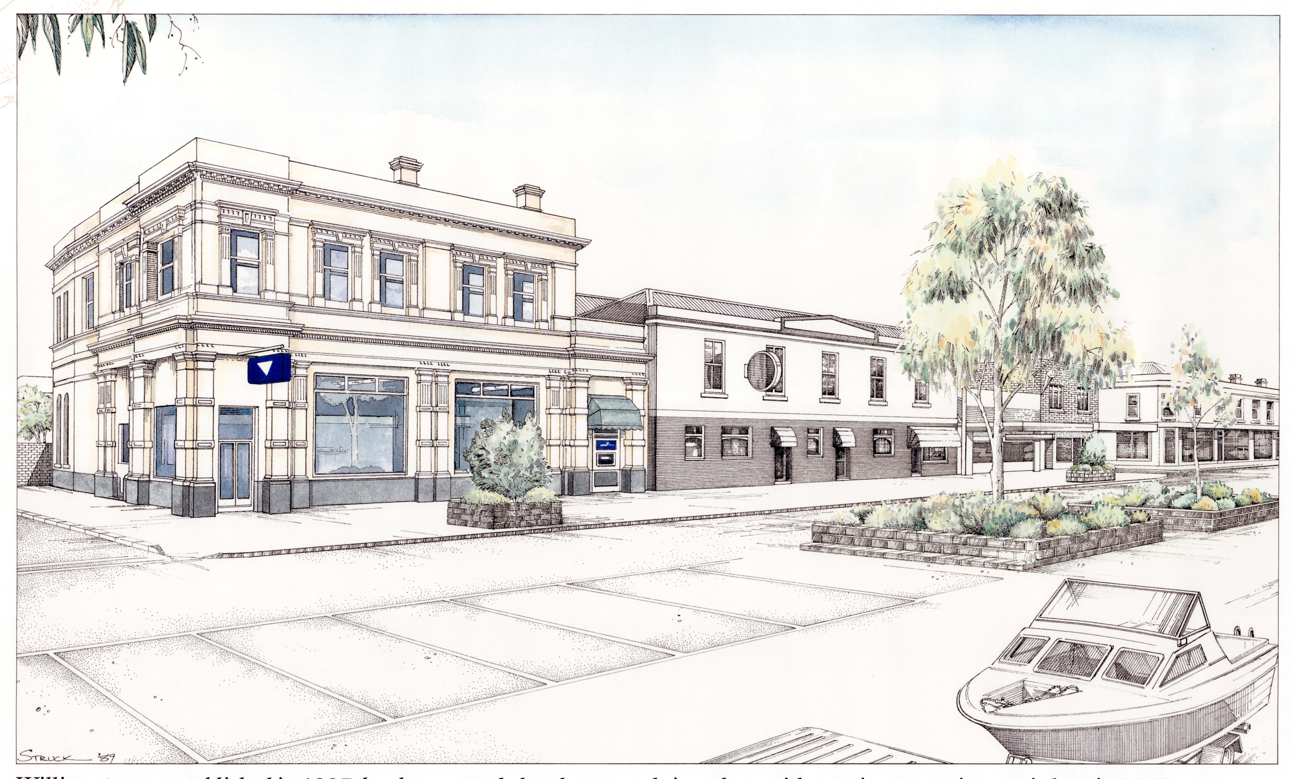
Williamstown – established in 1887, has been extended and renovated since then, with a major renovation carried out in 1961.