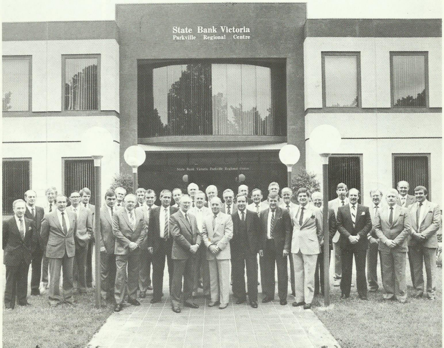
The first Regional Managers' Conference held on the 17th and 18th of November last year, at the Parkville Regional Centre. A second one was held this month