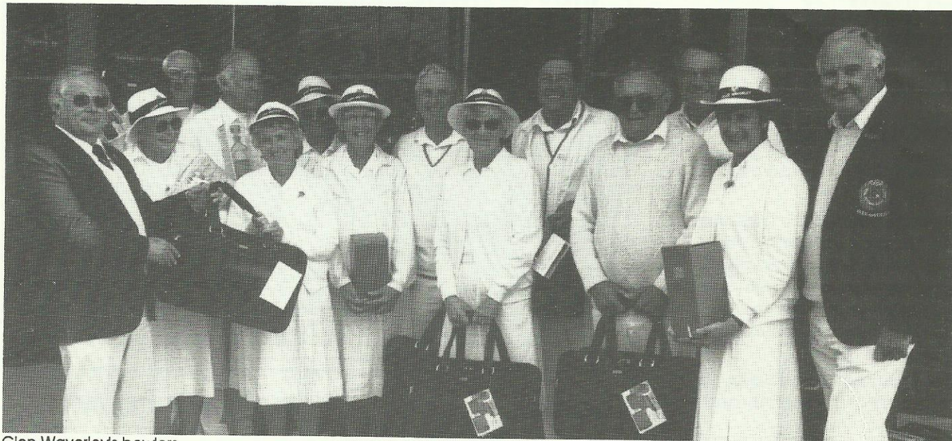
Glen Waverley's bowlers

Glen Waverley bowls club has had a highly successful mixed fours tournament, thanks to sponsorship from our Bank.